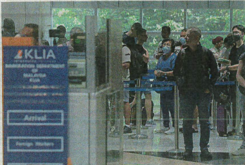
Smooth passage: Travellers arriving at KLIA in Sepang queue up at the arrival area.

"Stricter Covid-19 measures also have to be considered if hospitalisation and intensive care units usage reach more than 30%," he said.